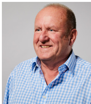
Ian Livingstone, CBE, Co-Founder of Games Workshop and Non-Executive Director of Sumo Group PLC