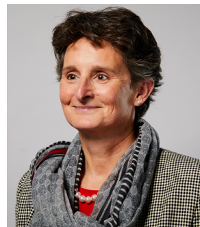
Flick Drummond, Former Member of Parliament for the Portsmouth South constituency