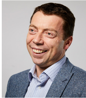
Lord McNicol of West Kilbride, Former General Secretary of the Labour Party